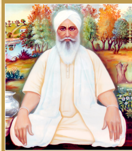
His Holiness Sant Attar Singh Ji ਸੰਤ ਅਤਰ ਸਿੰਘ ਜੀ (ਚੇਰੂ ਸਾਹਿਬ)